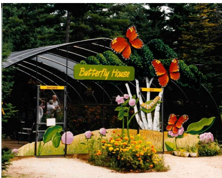
Butterfly House